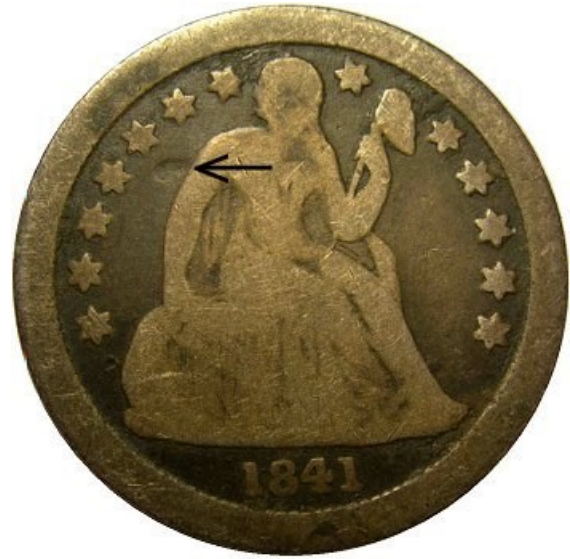
Figure 6: F-111 eBay Listing with Divot

per left obverse, occurred during the coinage process. The next logical step for developing an explanation is examining other striking anomalies seen on dimes struck that year and during 1842 since research suggests that some 1841 dated dimes were struck after 1842 dated coinage. We are aware of several filled die issues including the F-109a filled obverse die at Liberty's head and from an F-106 piece currently listed within my inventory. Please see Figures 7 and 8. Is the mystery divot on F-111 specimens caused by a filled die event? I tend to doubt this explanation.