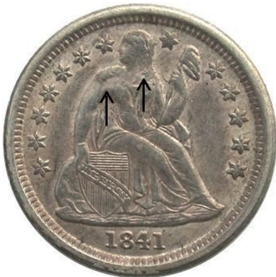
Figure 7: F-109a Filled Die Obverse

per left obverse, occurred during the coinage process. The next logical step for developing an explanation is examining other striking anomalies seen on dimes struck that year and during 1842 since research suggests that some 1841 dated dimes were struck after 1842 dated coinage. We are aware of several filled die issues including the F-109a filled obverse die at Liberty's head and from an F-106 piece currently listed within my inventory. Please see Figures 7 and 8. Is the mystery divot on F-111 specimens caused by a filled die event? I tend to doubt this explanation.