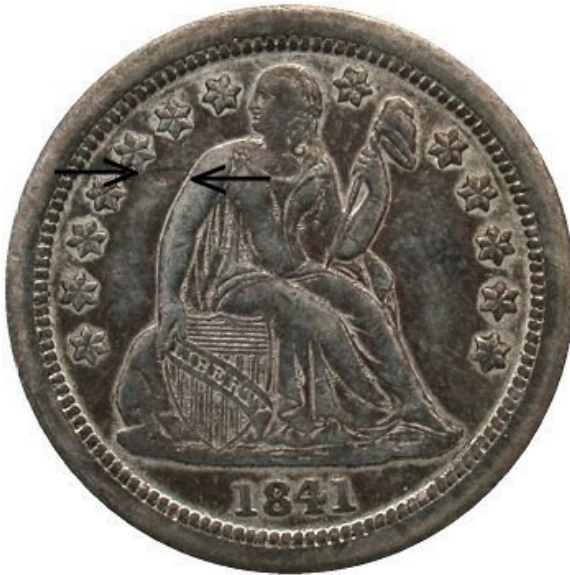
Figure 4: 1841-O F-111a with Obverse Divot

high grade F-111a example for the web-book. However, the divot bothered me as it did not appear to be the result of a post mint damage event but rather a potential filled die issue. Additional confirmation pieces would be necessary to validate my assumption and those were located after carefully searching on eBay.