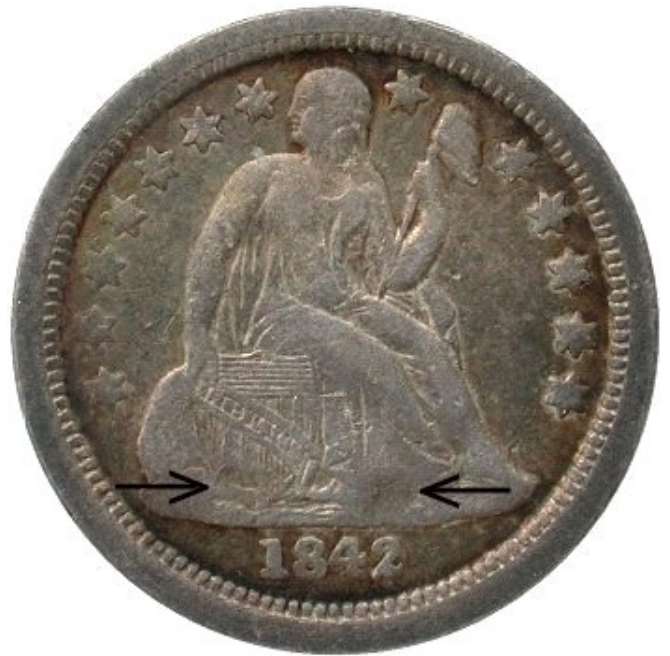
Figure 9: 1842-O F-101b with Depression