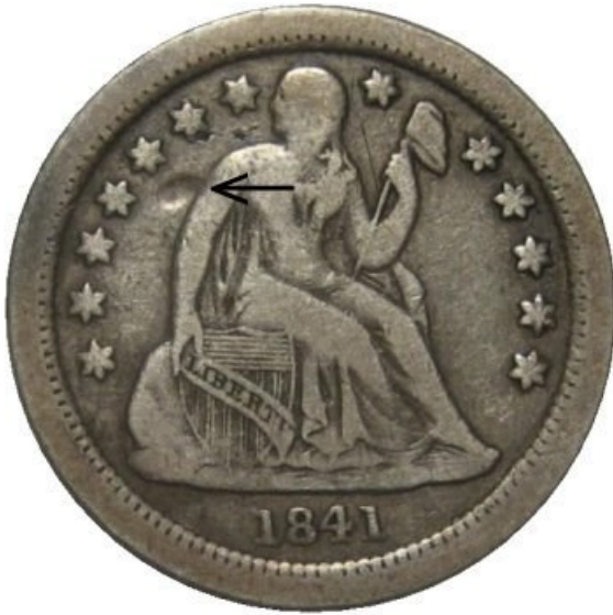
Figure 5: F-111 eBay Listing with Divot