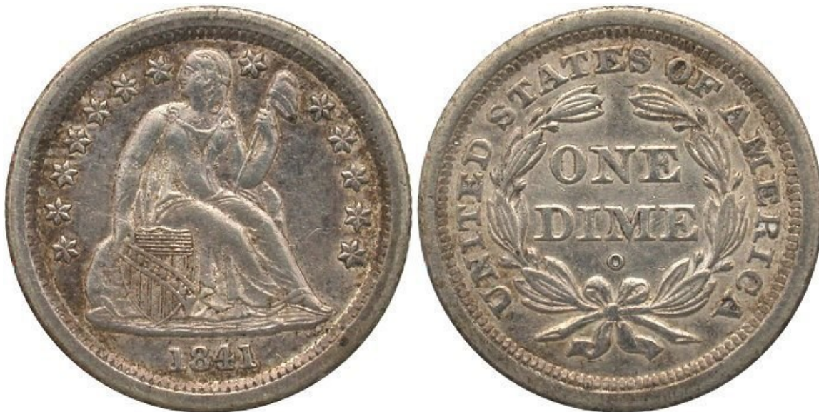
Figure 1: 1841-O F-111 with Rusted Obverse Die

As listed in The Definite Resource for Liberty Seated Dime Varieties Collector at www.seateddimevarieties.com , the 1841-O F-111 die variety results from the die pairing of Obverse 8 and Reverse K. Obverse 8 is easily diagnosed from moderate rusted die pitting throughout Liberty's gown lines and within the shield coupled with a low upward sloping date punch. Reverse K is in better condition with only a few die defects surrounding ICA in AMERICA along with a small O mintmark that is nearly centered about the two ribbon loops. This die pairing is not common and considered to be R4 in VF or better grades.