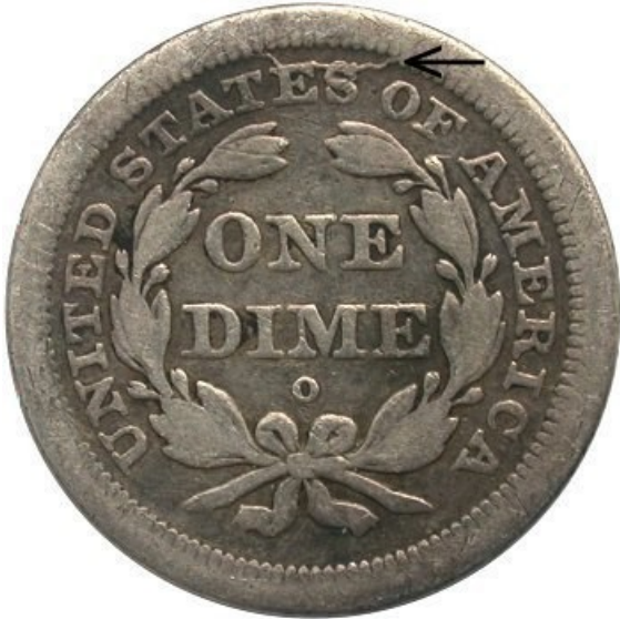
Figure 2: F-111a Cracked Reverse