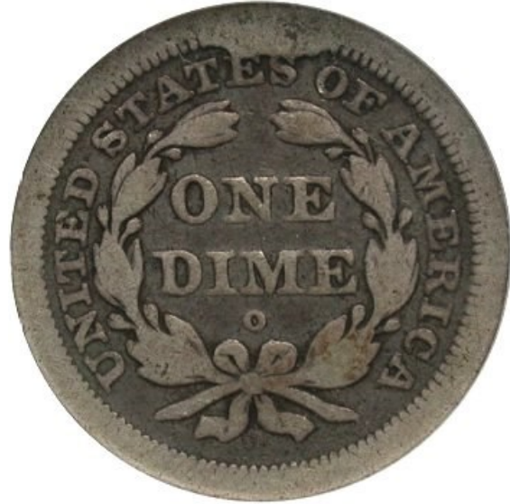
Figure 3: F-111b Reverse Cud

high grade F-111a example for the web-book. However, the divot bothered me as it did not appear to be the result of a post mint damage event but rather a potential filled die issue. Additional confirmation pieces would be necessary to validate my assumption and those were located after carefully searching on eBay.