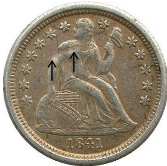
Figure 8: F-106 Filled Die Obverse

If not caused by a filled die, then what other obverse depression are known for 1841 and 1842 New