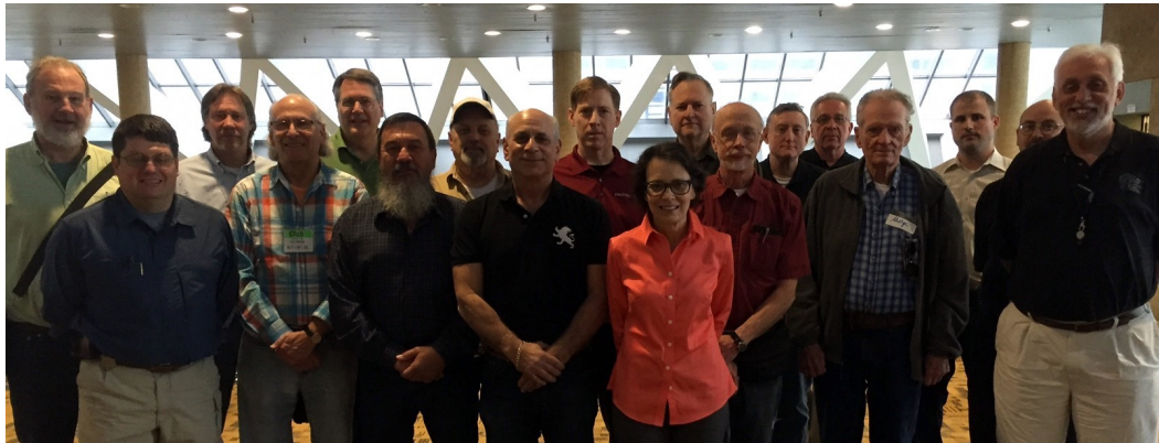
Whitman Baltimore Spring Expo LSCC Group Photograph