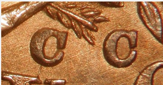
Reverse A – Low Close CC #1 – Rare, first C below second arrow barb, both C s tilted to the right