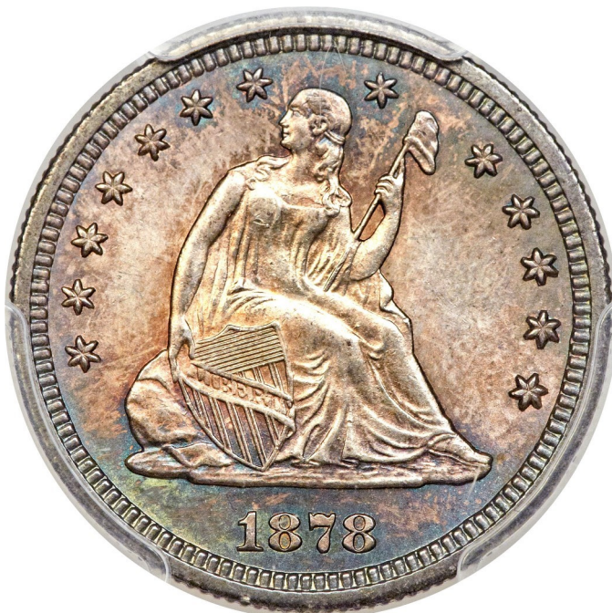
Figure 1: 1878-S 25¢ Obverse.