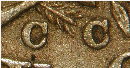
Reverse B – High Close CC – Very common, found on about 70% of known examples

The two common dies, representing over 95% of known 1875-CC examples: