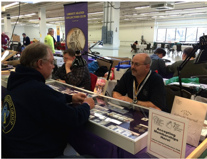
LSCC table at Manchester NH