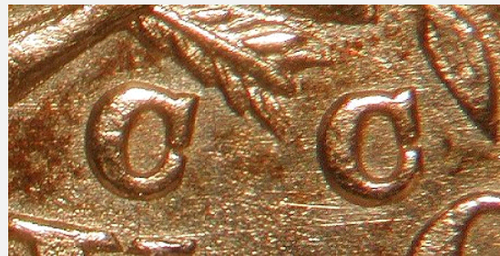
Reverse D – Low Close CC #2 – Very Rare, first C below second arrow barb, first C tilted to the right, second C tilted to the left