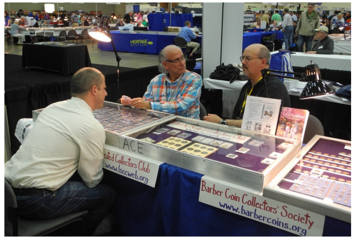
LSCC table at Baltimore