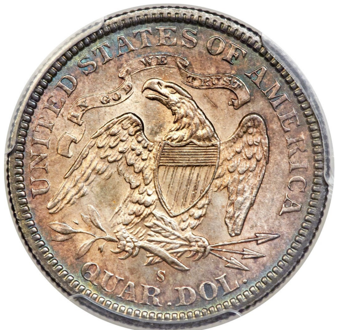
Figure 2: 1878-S 25¢ Reverse.