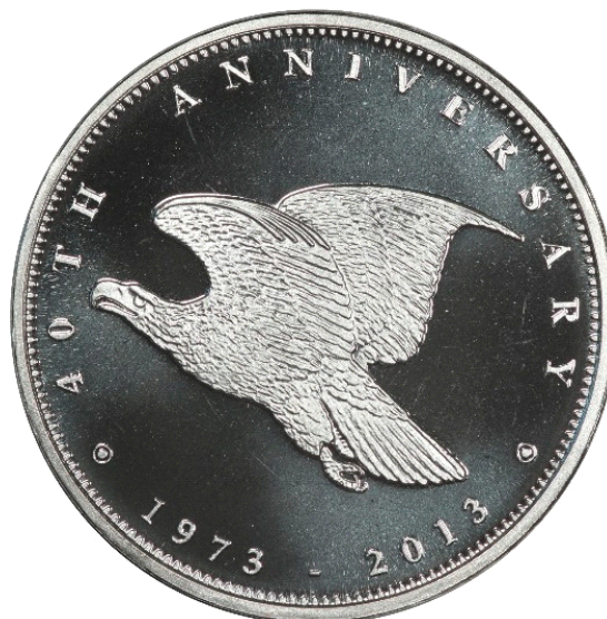
Photos of one of the two LSCC 40 th Anniversary medal Proof silver "Trial Strikes"