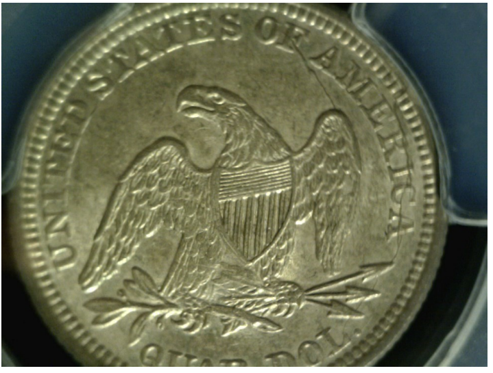
Figure 1: 1854 cud reverse quarter dollar