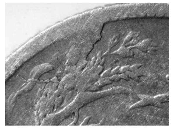
Shattered reverse details (11:00) from EF40 example

Note the significant damage to the reverse die at 9:00 and 11:00. The reverse cracks are severe with shelf metal seen in both locations. As a result of normal circulation and surface wear, these two raised metal areas can appear to be full fledged die cuds on lower grade dimes but in reality some die details remain present per the EF45 specimen.