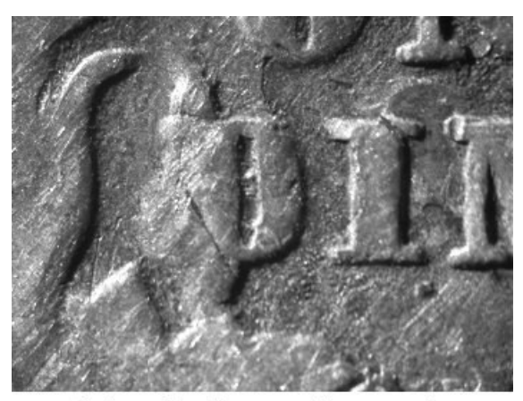
Internal cud connecting wreath to (D)IME

During the Whitman Baltimore show, LSCC South Regional Director Jason Feldman provided me with an 1876-CC dime that had a terminal die state reverse. The obverse and reverse devices lacked details though the dime appeared to grade strong VF to EF. Close inspection revealed the dime to be the Double Die Reverse variety and in a die state with shattered reverse die. The doubling on ONE DIME is no long visible but what immediately jumps out is the circulate die break and internal cud between the wreath and the denomination. Below at two macro images that capture the terminal die state characteristics. As a variety and terminal die state fanatic, I believe this dime ranks high on the cool scale!