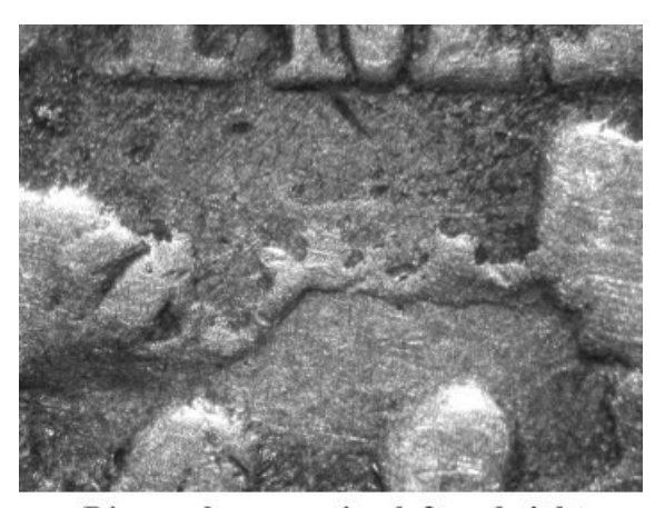
Die crack connecting left and right wreath leaves

Another important shattered reverse Seated dime appeared during November. The 1887-S date is well known for its popular F-107 shattered reverse variety that is also included in the Top 100 Varieties. Less known is the F-111a shattered reverse due to its rarity. Brian Greer first published a small reverse im-