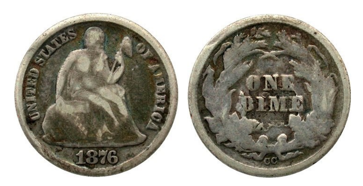
1876 Carson City - F-108b Terminal Reverse Die State

November was a busy month at Rare American Coins with the ability to view many Liberty Seated dimes passing through inventory as consignments and customer sales. During the month, two important shattered reverse dimes surfaced and I believe it is essential to document these for future collector reference. Significant Liberty Seated dime variety specimens have a habit of disappearing quickly from the market and their existence may never be known by the majority of collectors. For more details beyond this article, interested readers can check each of the new variety listings at <a href="https://www.SeatedDimeVarieties.com">www.SeatedDimeVarieties.com</a>.