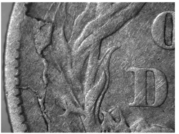
Shattered reverse details (9:00) from EF40 example