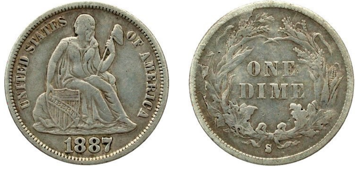
1887 San Francisco – F-111a Terminal Reverse Die State

age of this variety on page 184 of his Guidebook but does not assign a Greer number. I purchased his plate coin and used it to illustrate the F-111a variety in my web-book. Locating a higher grade example has been nearly impossible but an EF45 details example finally surfaced in November as is shown below.