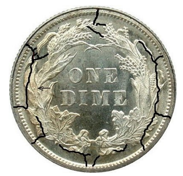
1877 Type II F-115

And finally the 1877 F-115 reverse die that lead to this article. The die crack pattern is typical for With Legend dimes as the reverse die cracks on the outer edges of the wreath are due to planchet induced metal flow stress. This stress originates at the center of the die and migrates to the edges. The stress is probably at its highest in the area between rim and outer wreath due to the metal flow force as metal is trying to fill in the wreath devices. In the case of this 1877 reverse die, the late die state reveals not only the radial cracks but the multiple spurs to the rim. The 1891 New Orleans date is also another opportunity for extensively cracked reverse dies in this same pattern.