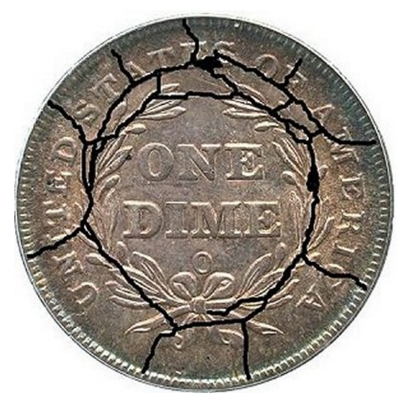
1839-O F-106a -Cobweb Shattered Reverse