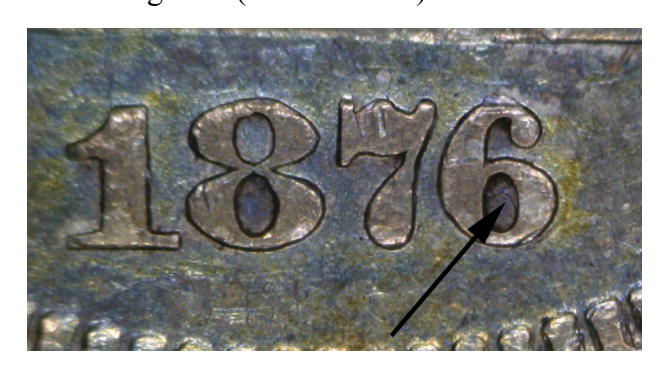
and 1876-CC Obverse 1 in Figure 6 (one the following page)...