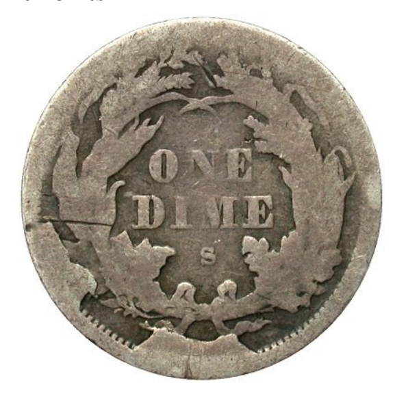
1875-S In Wreath F-105a

This 1875-S In Wreath shattered reverse is fairly common in circulated and mint state grades. It can be located in different die states including a double cud terminal die state. The double cud dime was purchased at the 2013 Chicago ANA show from Harry Smith. I'm sure someone will count the black lines into the rim on the below image. I've discounted one of the tiny die cracks at 3:00 to have an entry for the Ten Rim Exit Point header.....again just having fun with this article!