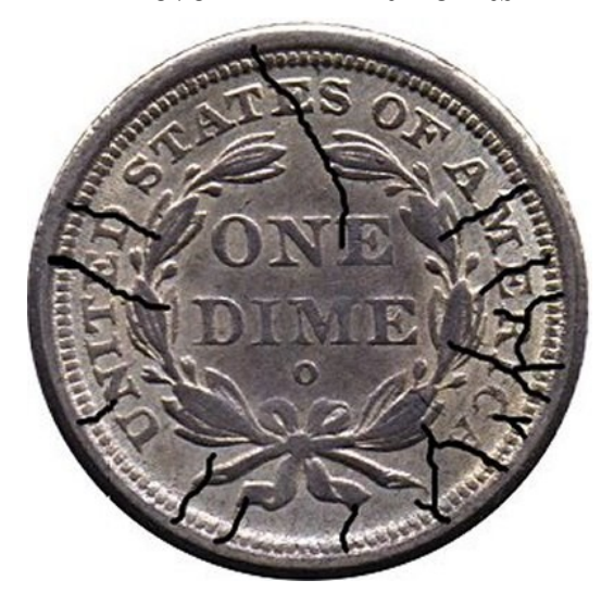
1841-O F-105 - Reverse of 1842-O

This reverse die is a transitional reverse used to strike New Orleans coinage in 1841 and 1842. Most interesting is that the terminal die state occurs when paired with an 1841 obverse die after striking coinage with an 1842 obverse die. This is my favorite terminal die state reverse along with the 1839-O Cobweb Shattered reverse (which is coming up soon,) What is so interesting about this shattered reverse is that the die cracks all align from center of die to rim and are not radial within the die's perimeter. Where is Chris Pilliod when you need a metal-lurgist to explain this phenomenon?