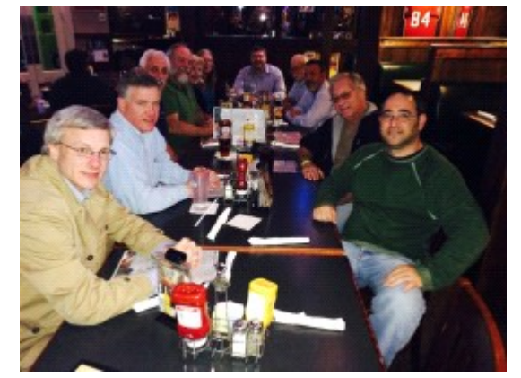
Attendees at the March 2014 Atlanta LSCC post-meeting gathering