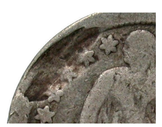
1843 Liberty Seated Dime

As always, collect what you like, get yourself to coin shows and auction lot viewings, talk to other collectors and develop a good relationship with one or more dealers. Healthy interaction with the collecting community will always be the best way to stay on top of the latest market trends.