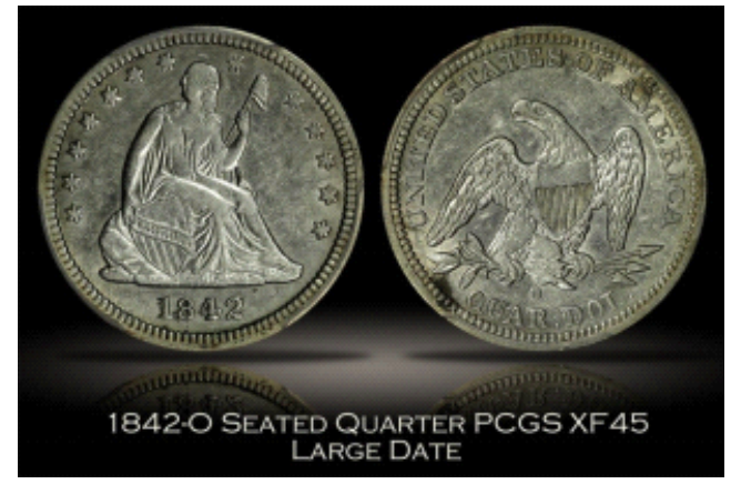
burner" by the discussion participants until Daryl discovered, and acquired, a second example (an ANACS EF40) having the same feature in December.

amples, when found, tend to be quite well struck and proof-like. There are eight die marriages listed in Briggs' Comprehensive Encyclopedia of United States Liberty Seated Quarters (Lima, OH 1991), the majority of which are individually very scarce. Having accumulated 7 of the 8 die marriages throughout a nearly 10year search, it grabbed my attention when collector Daryl Luke reported a possible new die marriage on the Liberty Seated Message Boards (http:// seateddimes.yuku.com) in May 2013. The coin he reported appeared to be an example of Briggs 4-F, a known die marriage, but with an extremely long middle studies and collects die varieties, and who as a result is claw on the left (facing) foot. This feature was not known on 4-F coins and led to speculation regarding die state, die scratch, or new die altogether. The coin, pictured in Figure 1 (below), resides in a PCGS XF45 holder. The discussion died out and the interesting anomaly was either forgotten or placed on a "back