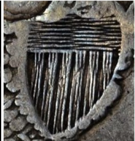
1838 double struck quarter dollar; (at right) close up of reverse shield