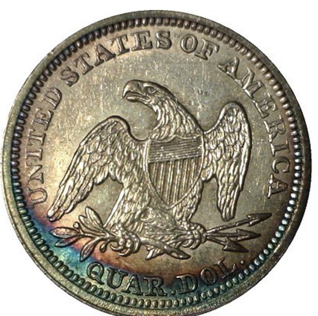
1861Type I Reverse

The picture (at left) of a lovely Type I reverse die is from Greg's article.