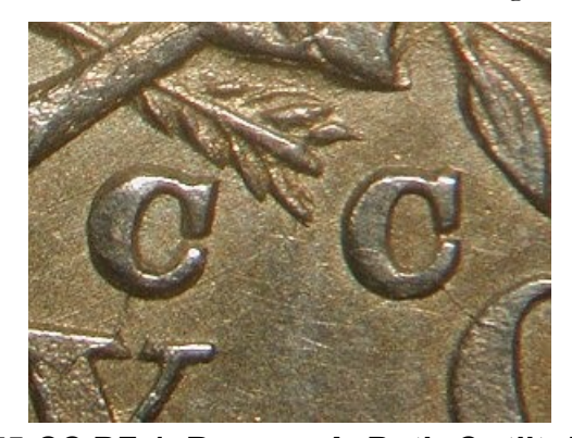
1875-CC BF-1, Reverse A, Both Cs tilt right

In mid-January, we took a closer look at the coin (mainly because of the exceptional proof-like reverse) and noticed that the second C was tilted at a different angle than found on the BF-1. It had to be new die altogether! Paired with the same obverse die as BF-1 and BF-2, Lane Brunner and I have designated this new die marriage as BF-5 . Based on obverse die state and die polish, we determined that this new BF-5 was struck after BF-1 and before BF-2. Below are close-up images of the mintmark position for both the BF-1 and BF-5, showing the first C is below the arrow, and the second C s tilt at different angles.