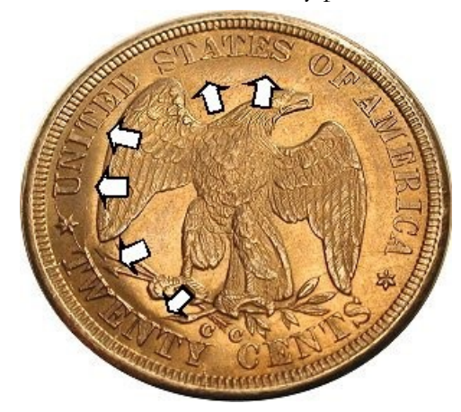
Buckled Reverse with Undulating Field

-5 took its place, buckled immediately, and was removed after perhaps a few hundred coins. Reverse B of BF-2 was then put into service and produced perhaps 100,000 coins without any problems.