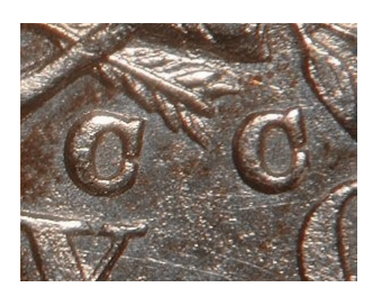
1875-CC BF-5, Reverse D, second C tilts left

We (along with some of our readers) reexamined our 1875-CC BF-1 examples and found that a second coin, also without die cracks, was indeed a BF -5. A third coin without die cracks was a BF-1 as originally attributed.