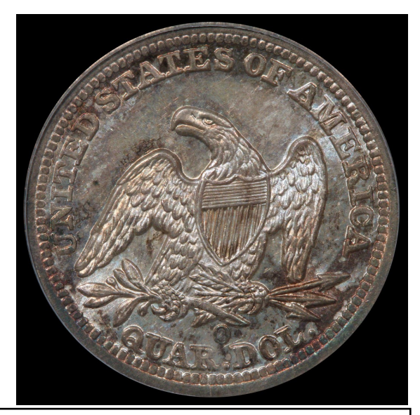
1850-O Quarter Briggs 1-B PCGS MS64 (Ex. Eliasberg).