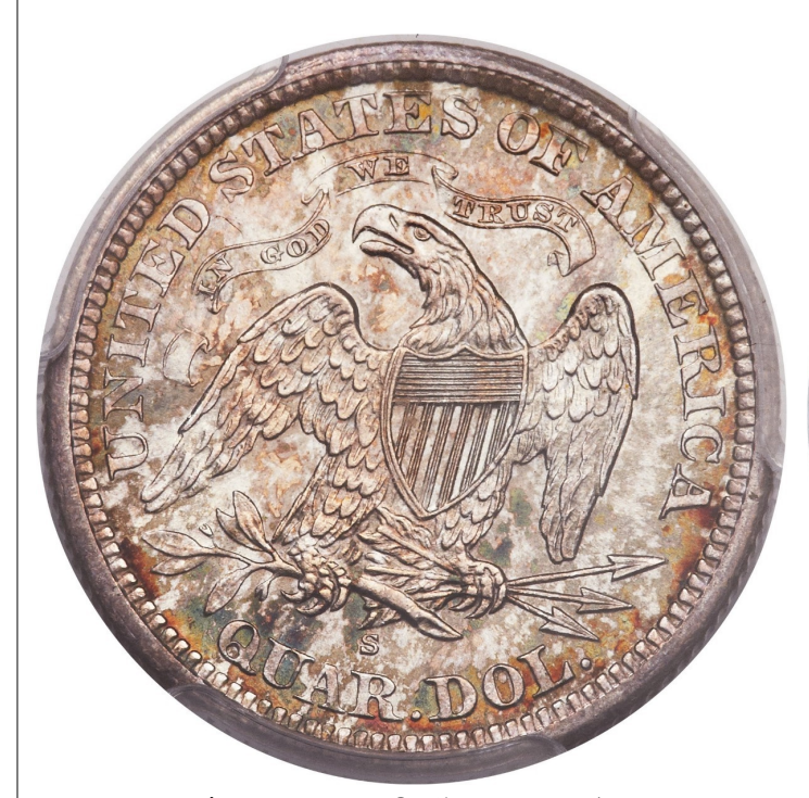
Figure 1: 1873-S 25¢ Reverse A.