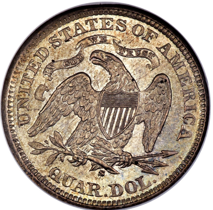
Figure 2: 1873-S 25¢ Reverse B.