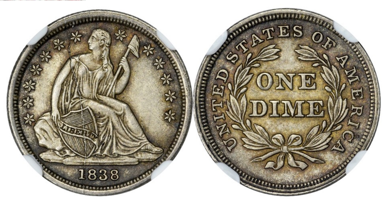
1838 Liberty Seated Dime, Fortin-106, R3

With a mintage of 1,992,000 pieces, the 1838 large stars, no drapery Liberty Seated dime is considered a common date in the series. The F-106, Cracked Obverse #1, perhaps best exemplifies a shattered obverse die and, in this case, one that is cracked from rim to rim. Although quite dramatic in appearance, it is also one of the most available of the 1838 die cracked obverse varieties.