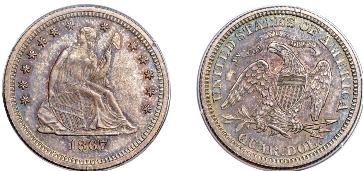
1867 Liberty Seated Quarter Dollar

Back in March of 2006 I was about two years into seriously building a Liberty Seated quarter set. One day at work I was eating lunch while checking out dealer websites and came upon a new listing for an 1867 quarter in VF/XF. The listing immediately captured my attention, as I had not had a single opportunity to purchase that date in the previous two years. There was no description nor image of the raw coin (this is 2006, remember), so I called the dealer. He described it as a nice, problem free, but darker than normal coin for which he wanted $475 shipped. Even 10 years ago that was a bargain price if the coin had been accurately described. And if it had not, there was a return privilege. To make a long story short, the dealer's description was spot on and the coin is now PCGS VF35 CAC.