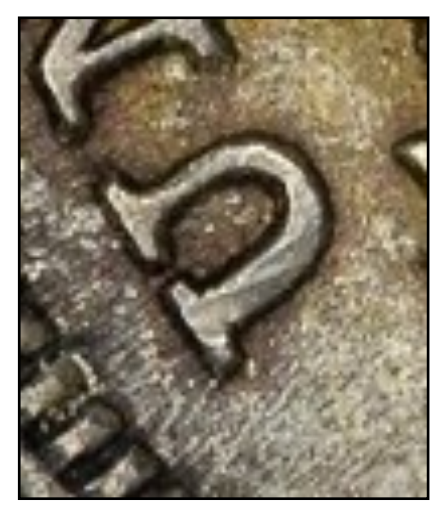
Die erosion between UNITED and dentils

1838 Liberty Seated Dime F-106 reverse die diagnostics