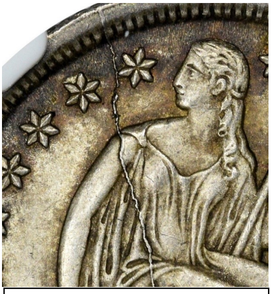
Obverse, 1838 F-106 Dime

The quite significant die crack starts at the upper rim between starts 6 and 7 and goes completely across the image Lady Liberty to the top of the shield. The crack continues fully through the shield, splitting the R of LIBERTY, passing through the lower left serif of the 1 date digit, ending at the lower rim.