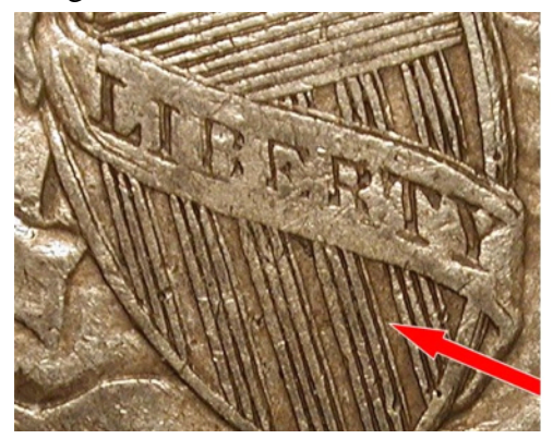
1844 Dollar, Business Strike Quad Stripes

seen several very-well-struck proof-like 1844 business strikes, it simply didn't trigger anything in my mind. But with the 3 lines, I realized this coin had to be a circulated proof. I really felt stupid for not noticing this before I bought it.