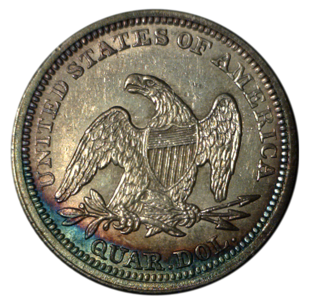
(1861 Type I Reverse quarter dollar)