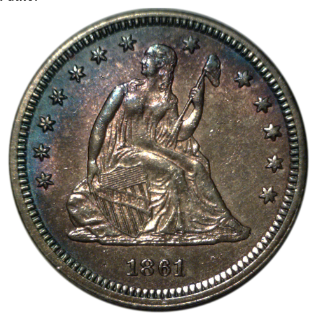
(1861 Type II Obverse quarter dollar)

search began with 18 months of futility, followed by one example each year for three years. Then, during early 2010, five examples appeared in the space of about 3 months, followed by 9 months before a single additional example was offered. The search has included EBay listings, several major shows per year, and more than a dozen dealer websites over a period covering more than 5 years. A total of 9 examples were located during that period. [This is] A particularly low number considering just how ubiquitous the 1861 is as a date.