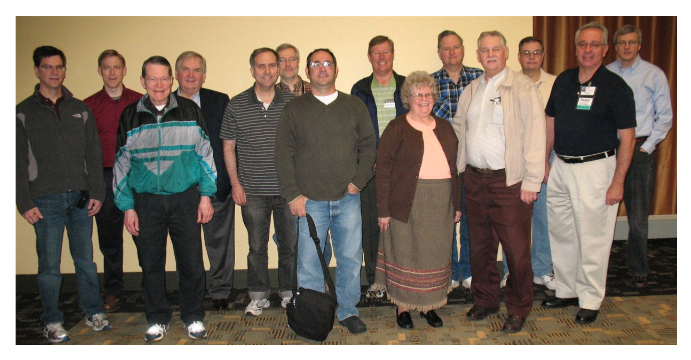
April 1, 2011 Baltimore LSCC regional meeting attendees

The meeting formally adjourned about 10 A.M. but attendees stayed to discuss Liberty Seated coins and enjoy Shirley Hammond's delicious cookies.