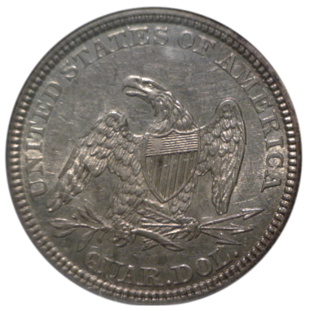
(1859 Type II Reverse quarter dollar)

The 1861 Type II/I quarter is a very rare coin, which one noted expert has compared to the 1853 No Arrows in terms of overall rarity in all grades. It is even more interesting as a very rare variety of a very common date. Since Heritage began archiving photos on their website a total of 195 business strike 1861 quarters have been offered for sale. The single confirmed Type II/I example was sold in 1999 and resides in a SEGS XF40 holder. Seven of the 81 examples of the 1861 reported in the 1993 survey were Type II/I; five of the 57 examples reported in the 2007 survey were Type II/I. More than five years of diligent searching has led me to estimate that, contrary to what the survey numbers appear to indicate, the Type II/I represents less than one half of one percent of the 1861 quarters currently available in the marketplace. The