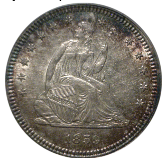
(1859 Type II Obverse quarter dollar)

The 1859 Type II/II is a rare coin that is seldom available. Since Heritage began archiving photos on their website a total of 74 business strike 1859 quarters have been offered for sale. The single Type II/II example among them was a cleaned F12 in a SEGS holder sold during 1999. Thirteen examples were reported in the 1993 LSCC survey and seven were reported in 2007, out of a total of 57 and 51 examples of 1859 quarters that were reported in 1993 and 2007, respectively. Personally, in searching all the 1859 quarters I could find for over four years I have seen three examples of the Type II/II – one XF, one AU, and one MS62. I found two examples within 6 months during 2007 and then went more than three years before finding a third example.