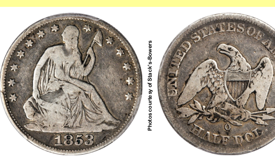
The 4th 1853-O NA half dollar - PCGS Secure VG8

What could possibly trump [Yep, I'm a bridge payer—Ed.] last month's announcement of the 4th known 1842 SDSL half dollar? Well we have another announcement this month! Another 4th known—the 4th known 1853-O No Arrows and Rays half dollar! After over 100 years, another example has been found and with an incredible story.