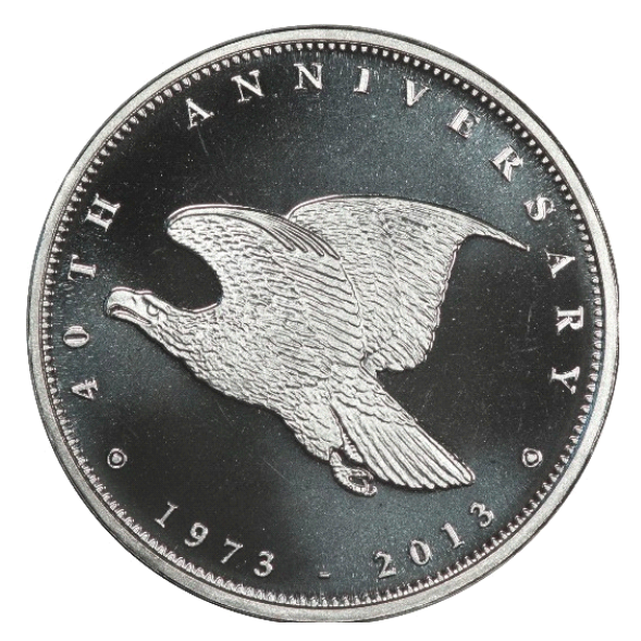
Photos of one of the two LSCC 40<sup>th</sup> Anniversary medal Proof silver "Trial Strikes"