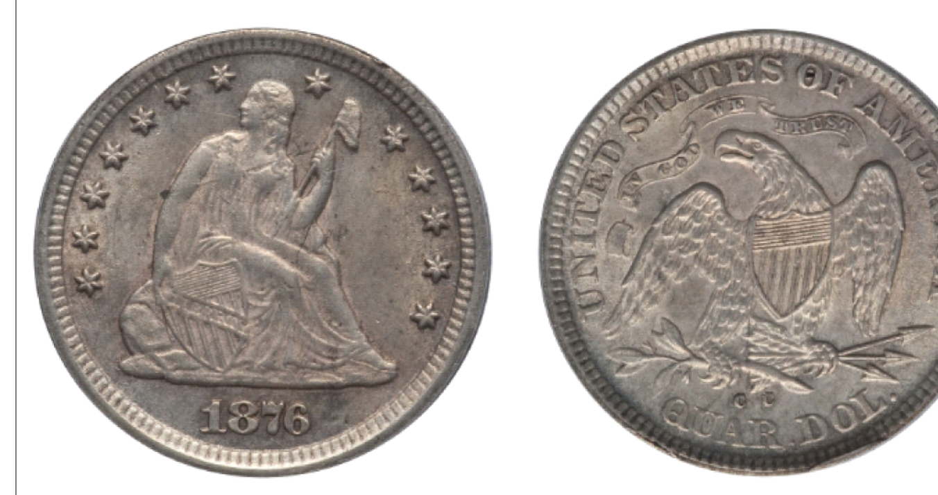
Figures 3 and 4: 1876-CC Quarter with Reverse of 1873-CC NA

No quarters dated 1874 were struck at the Carson City mint. When production resumed in