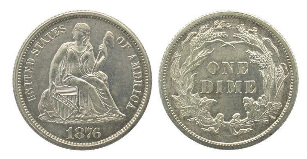
Fortin 103 – Obverse 3 / Reverse C, Repunched 1 (Ahwash 6)

Can be identified by date position DR 1L with a repunched 1 digit; repunching on top of flag. Reverse seen with early and late die states; later die states exhibit die cracks throughout the wreath. Not pictured in Ahwash's Encyclopedia but listed as A-6. Strong strikes are available.