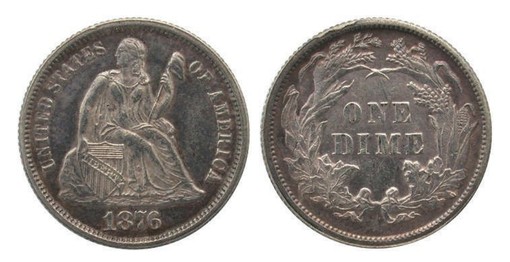
Fortin 104 – Obverse 4 / Reverse D (Ahwash 7)

Date placement is furthest left of the 1876 Type II varieties; date measurement is DR 0C. Comes fully struck and is the second easiest to locate after F-101. Reverse will show some minor die cracks on the right ribbon and in the lower left wreath.