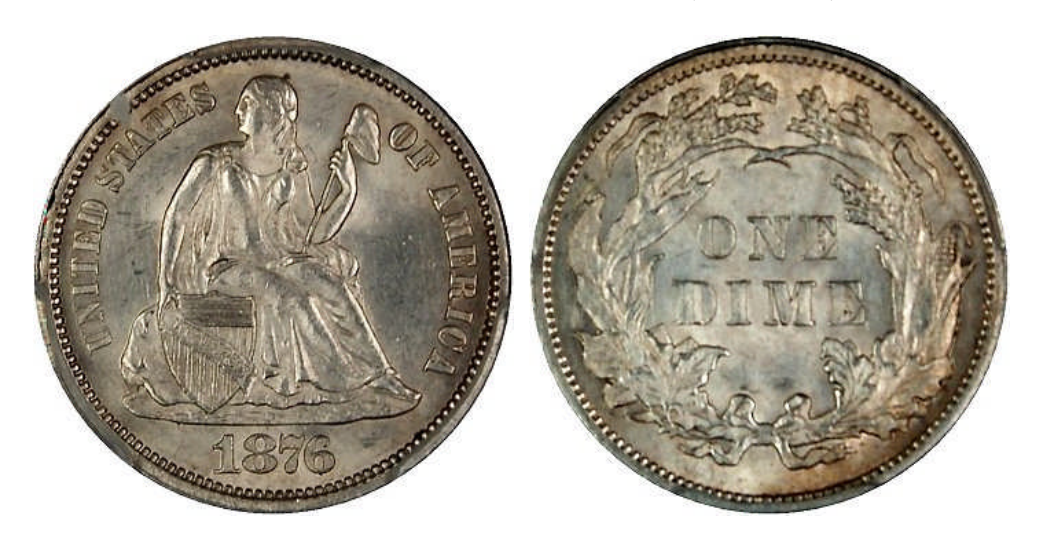
Fortin 102 – Obverse 2 / Reverse B (Ahwash 5)

Infrequently seen and high R4 to low R5 in Extra Fine or better grade. Date position is DR 0R and note the irregular appearance of DIME on the reverse. The I and M in DIME are poor aligned with the outer letters D and E. Only several examples seen with strikes being variable. Ahwash did not publish images for A-5 listing; this die pair best matches his description.