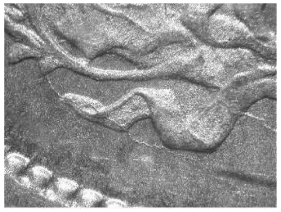
Type II - Single left ribbon end