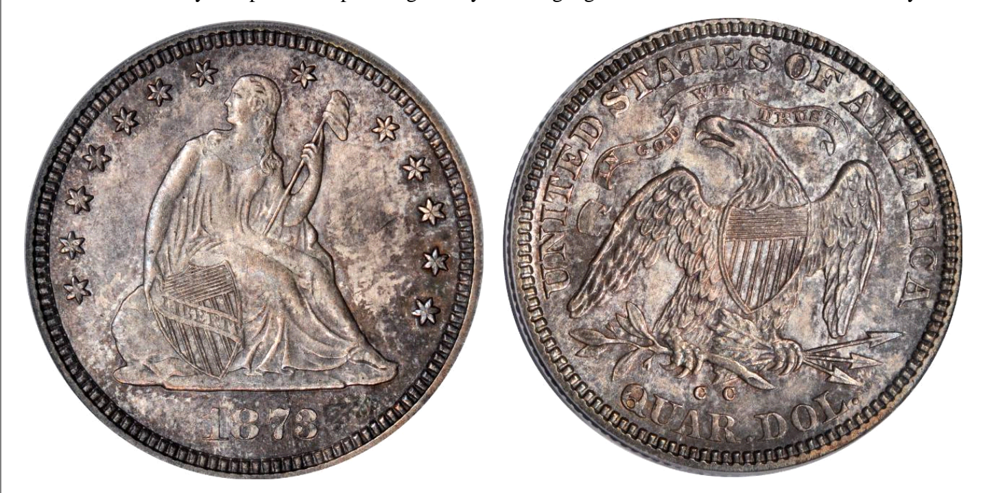
Figures 2 and 3: 1873-CC NA Quarter—Battle Born Collection

This month's variety, which will be the 30th and final coin on the survey, is the 1876-CC, Briggs' 1-A and 2-A, reverse of 1873-CC No Arrows. This is an intriguing variety due to the fact that, whereas the vast majority of collectors will never own an 1873-CC No Arrows quarter, the 1876-CC is a quite common and inexpensive coin. The 1873-CC No Arrows quarter has long been recognized as a great rarity, with a mere 5 specimens known from an original recorded mintage of 4,000. The second finest of the five known specimens (Figure 1 below) sold for $460,000 this past summer as Lot 11094 in the Stack's Bowers ANA Sale of the Battle Born Collection. If you are a Liberty Seated enthusiast and do not yet have a copy of the Battle Born Collection catalog – get one now! It is a must read for anyone