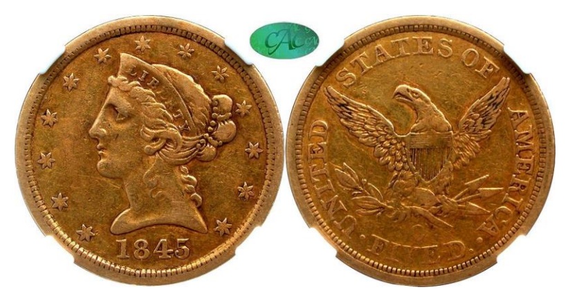
1845-O Liberty G$5, NGC EF40 CAC, Choice Original. The surfaces of this CAC-approved New Orleans five exhibit warm, orange-gold shading and are complemented by generous amounts of copper-red patina in the protected areas. Fields are smooth for the grade and reveal a few lines as expected, while light dirt resides in the bun and wings. This is a lower mintage issue, with 41,000 pieces struck, and the Doug Winter reference indicates a current population of 150-175 coins. Winter 1, the only variety for this issue. CAC reports 37 pieces in all grades. The CAC price guide value in EF40 is $2,400. Housed in a newer NGC holder with CAC approval.