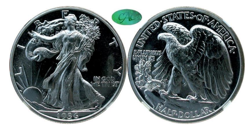
1936 5oC, NGC PF66 CAC, Gem Original, Island Lake Collection. This is stunning proof Walker with deep, glassy fields and icy central figures. The familiar "black and white" effect is readily evident as the coin is tilted under a light. The Mint produced 3,901 examples this year, the lowest total in the proof Walker series, and CAC has certified only 35 of these finer, all at the PR67 level. The CAC price guide value is $5,750. This piece originates from the Island Lake collection, an especially picky consignor with an instinctive eye for the best coins. Housed in a new large font NGC holder with CAC approval.