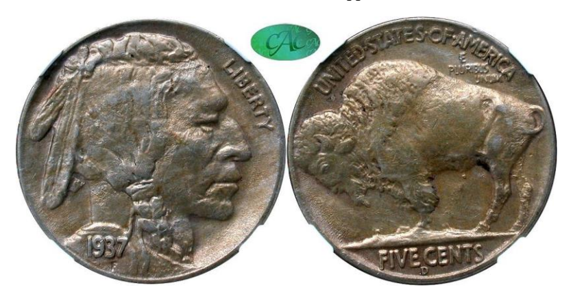
1937-D 3 Legs 5C, NGC AU58 CAC, Popular Variety, Choice Original, Osprey Collection. The three-legged Buffalo is one of the most widely recognized varieties in the U.S. coinage series, and many kids of a certain generation were constantly on the lookout for this, the 1955 Doubled Die cent, or the holy grail of them all, the 1909-S VDB Lincoln. Few succeeded in locating any of these in pocket change, but it was not for lack of trying! Today, the variety still merits a separate listing and illustration in the Guide Book. This example reveals scattered, light tan color atop nickel surfaces. The CAC price guide value in AU58 is $2,550. Housed in a new large font NGC holder with CAC approval.