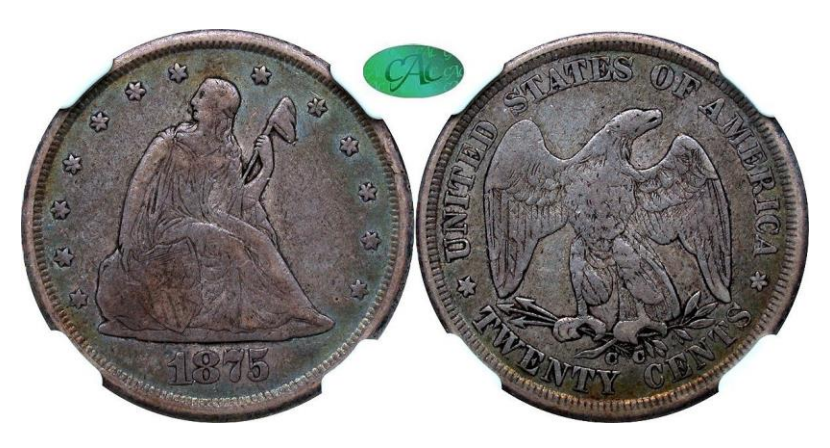
1875-CC BF-2 20C, NGC VF35 CAC, Choice Original, Mountain View Collection. Aquamarine-gold and rose hues are quite pleasing while the fields are unabraded on the 1875-CC BF-2 double dime. Bright light inspection exposes residual steely luster. The overall presentation is above average. The CAC price guide is $858 as reference. Housed in newer NGC holder with edge view insert and CAC approval.