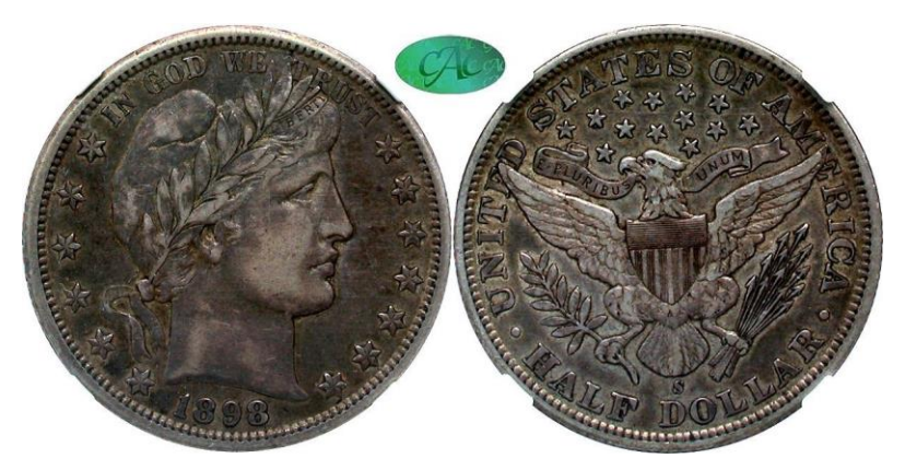
1898-S 50C, NGC EF45 CAC, Choice Original, Black Point Collection. Deep gray patina fills the obverse fields of this San Francisco piece, while the reverse is more lightly shaded and reveals additional gold color above the eagle. A distinct mintmark tilts noticeably to the right. This is not a scarce coin, with a mintage of nearly 2.4 million pieces, but the situation is more challenging when considering CAC approval. Indeed, the CAC population is only 31 examples in all grades, with 14 coins finer. The CAC price guide is $546. Housed in a new large font NGC holder with CAC approval.