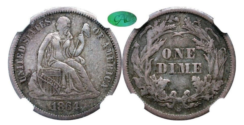
1864-S F-101 10C, NGC VF35 CAC, Choice Original, Oregon Beaver Collection. Coin gray surfaces admit subtle rose shades, with deeper color evident in the protected areas. F-101, the only die pair for the 230,000 strikes this year. The CAC population is a low 24 pieces in all grades. The CAC price guide value in VF35 is $748, rising to $998 in EF40. The market has not yet fully recognized the scarcity of original pieces, but the trend is clearly moving in that direction. Housed in a newer NGC holder with edge view insert and CAC approval.