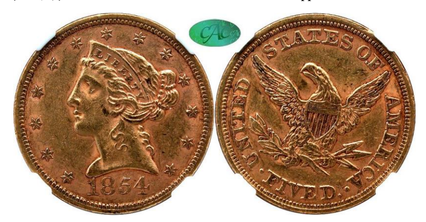
1854 Liberty G$5, NGC AU58 CAC, Choice Original, Port Matilda Collection. Rose-gold patina fills the protected areas and contrasts neatly with deeper color in the fields and high points of the portrait. Light crust is evident in the braids and shield. Examples of the 1854 half eagle issue are not rare but do become more challenging at higher grades. This near-MS example is an attractive piece that resides at the upper end of the CAC census, which notes 113 pieces in all grades, and 18 coins at the Mint State levels. The CAC price guide value is $1,590. Housed in a new large font NGC holder with CAC approval.