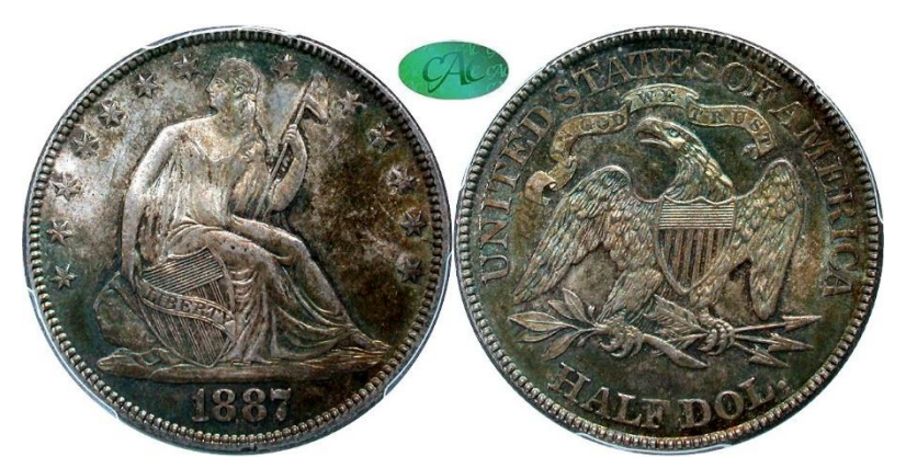
1887 50C, PCGS MS63 CAC, Near Gem Original. Yet another near-gem offering with important Seal Beach and Oregon Beaver Collection pedigrees, this better-date Seated half exhibits a background of blue, green, and gold, with the lighter figures that contrast nicely with the mirrored fields. Strike is typical, with some flat stars and merged detail below the reverse shield, but the decisive factor remains the overall, positive eye appeal. Housed in a PCGS Gen 6.0 holder with CAC approval. Ex. Seal Beach and Oregon Beaver Collections.