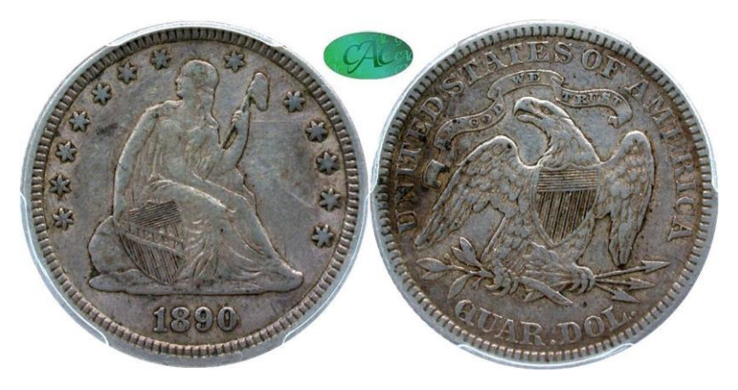
1890 25C , PCGS AU50 CAC , Choice Original , Saw Mill Run Collection . The second to last year of Liberty Seated quarter production at the San Francisco Mint brought only 80,000 strikes. The 1890 date is constantly in demand and never lasts long on the GFRC price list. This wonderfully choice example, from the Woodbridge Collection, also sold prior to reaching the price list. Surfaces are toned an even gray-gold and do not impede the underlying steely luster. Bright light viewing exposes lovely rose shades. Fairly graded and housed in PCGS Gen 6.0 holder with CAC approval.