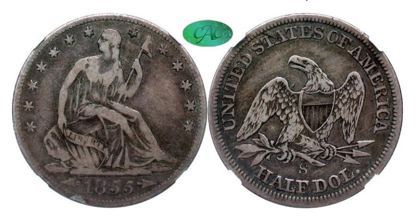
1855-S WB-1 50C, PCGS F15 CAC, Choice Original, Mountain View Collection. Liberty Seated half dollar collectors should take heed of this important Mountain View Collection release. 1855 brought the first half dollar production at the west coast mint to help fuel expanding commerce. Most survivors, from a mintage of 129,950, will be found with one issue or another. This CAC approved example is toned a moderate coin gray with darker shades at the peripheries. Surfaces are unabraded though there is a single rim bruise to the left of the date. CAC population stands at 17 with the next best being a VF25 before rapid pricing escalation. A noteworthy opportunity for those collecting circulated halves. Housed in new large font NGC holder with CAC approval.